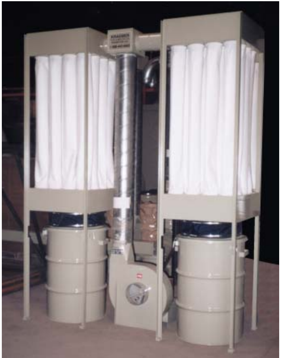
KTM EP 5-32 Dust Collector