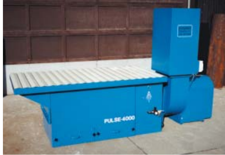
KTM Pulse 4000